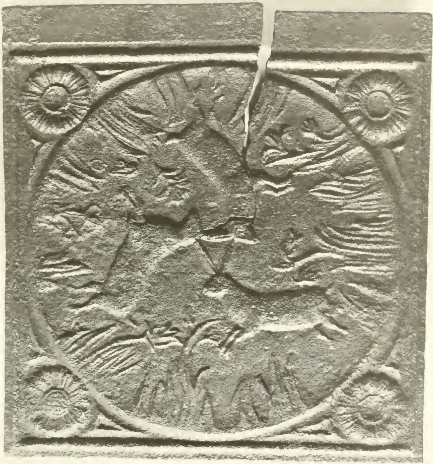
Stove plate by the Redwell Furnace; cast iron; Shenandoah Co., Va.; 1790–1800. HOA 21"; WOA 23". MESDA acc. 3290.2.